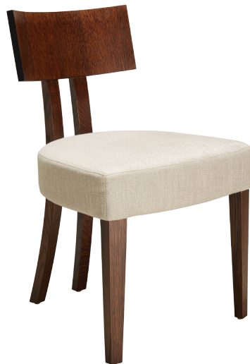
pictured as chair