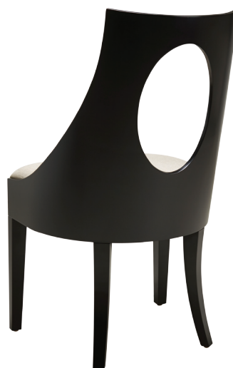
pictured as chair