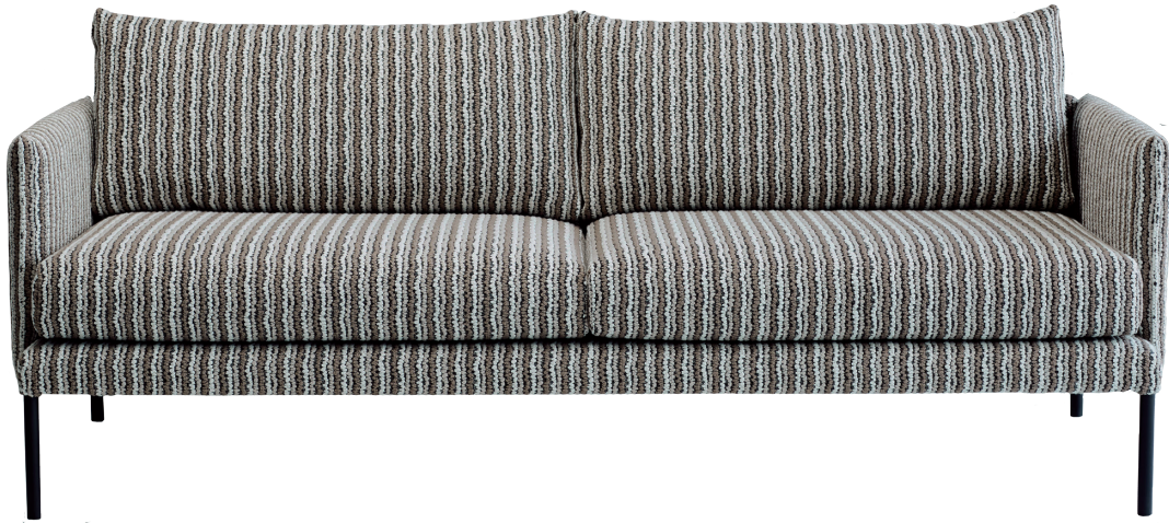
pictured as 3.0 seater