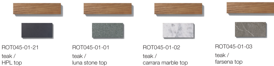
ROT045-01-21 teak / HPL top