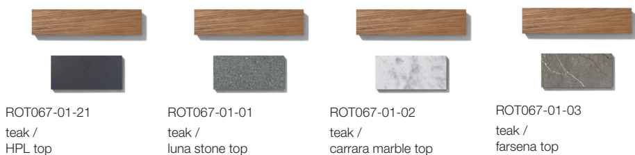
ROT067-01-21 teak / HPL top