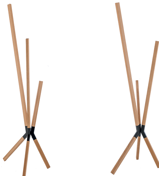
pictured as coat/hat stand