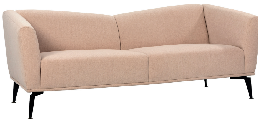
PICTURED AS 2.5 SEATER

LEG INFORMATION: 57 (200mmH) LEG COLOUR/FRAME: Powder coated metal Colour: Ironsand