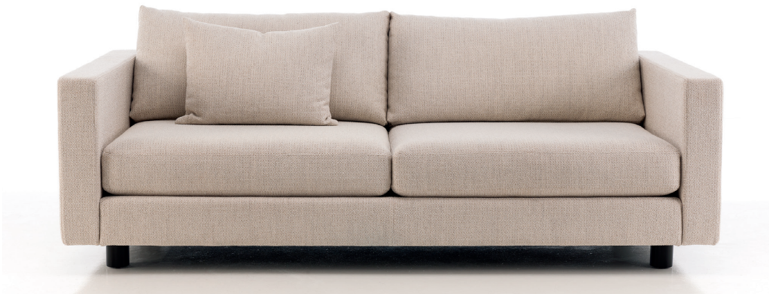
PICTURED AS 2.5 SEATER

LEG INFORMATION: 65 (100mmH) LEG COLOUR/FRAME: Black Stain