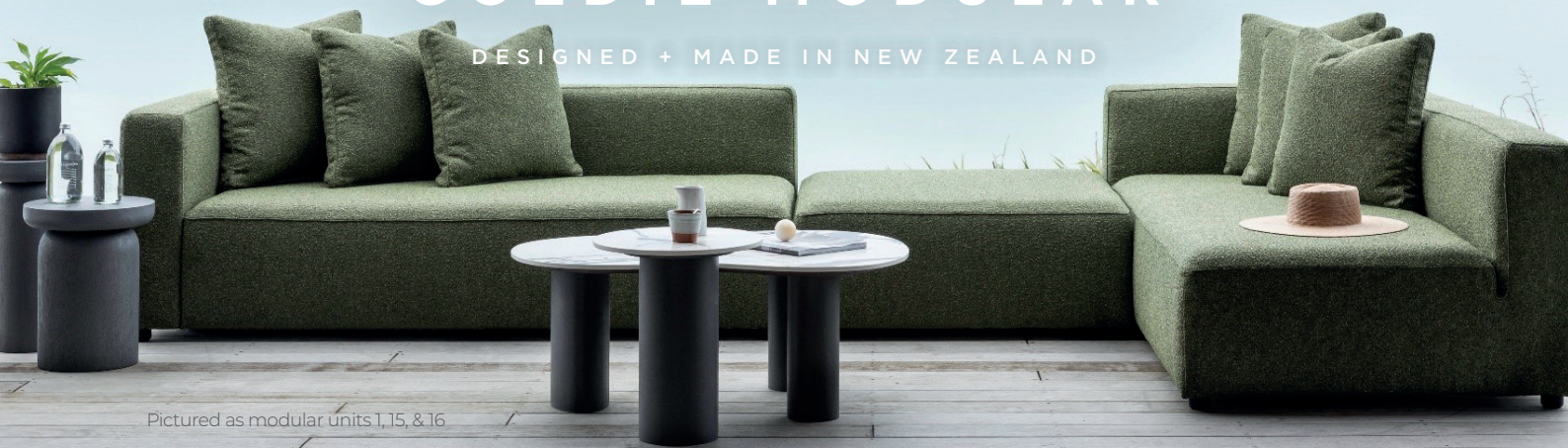
Pictured as modular units 1, 15, & 16